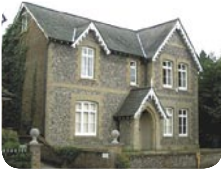
8 Fairfields Road

The flint and buff brick walling of no. 8 Fairfields Road is individually notable for its contrast to the red brick of almost every other building in the area. It is handsomely and individually designed and of late 19th century origin.