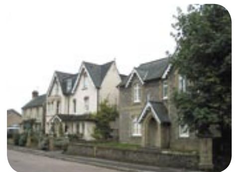
Nos 4 to 8 Fairfield's Road