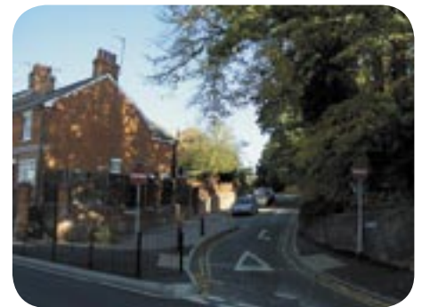
Bounty Road - historically known as Back Lane