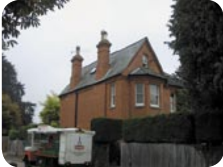
18 Cliddesden Road - red brick walling