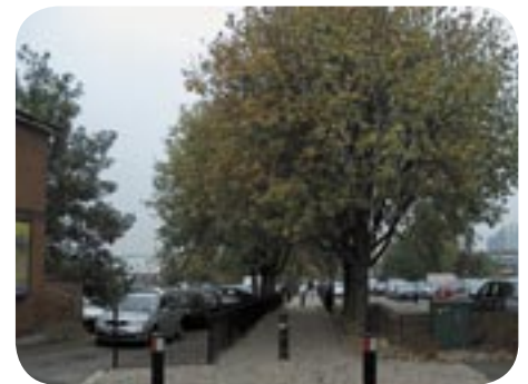
View out of the Conservation Area north towards the Town Centre