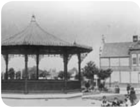
The Recreation Ground