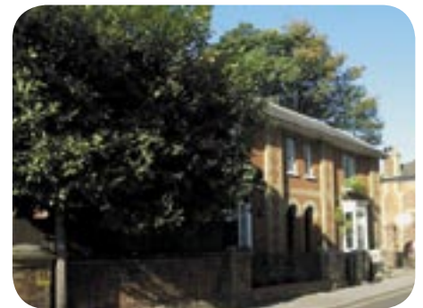
33 and 35 Winchester Road