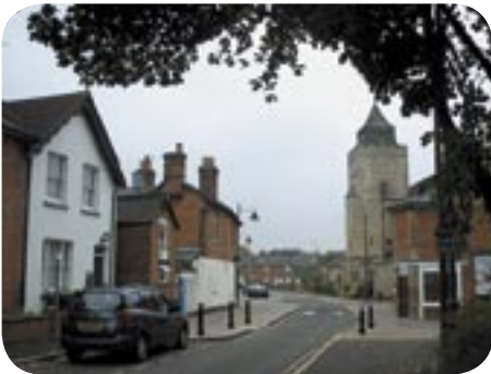
View westwards from Southern Road towards Victoria Street