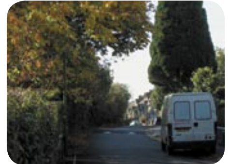
Trees lining the Southern side of Bounty Road

The War Memorial Park is on the eastern-most boundary of the Conservation Area where it directly abuts the boundary of the Basingstoke Town Conservation Area. With direct links into the Park, the mature trees and the boundary wall of the Park that runs along Hackwood Road, there is a clear definition between the two Conservation Areas.