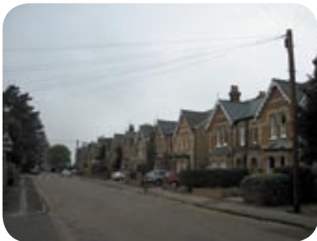
Nos 1 to 18 Fairfields Road

Lining the southern side of Southern Road is a series of terraces of Victorian and Edwardian dwellings, of varying character. This group is punctuated at the eastern end by nos 1 to 17 (which sit atop a high retaining wall), and at the western end by the corner shop that continues the terrace into Jubilee Road.