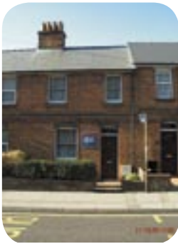
Timber sash windows and slate roofing in Winchester Road