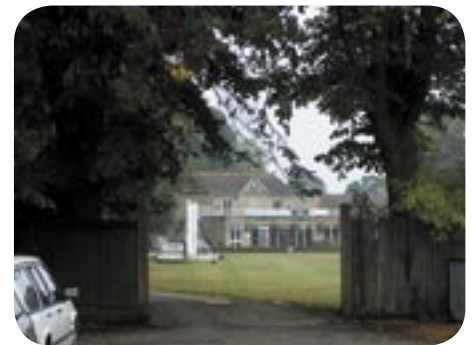
The Pavilion at May's Bounty