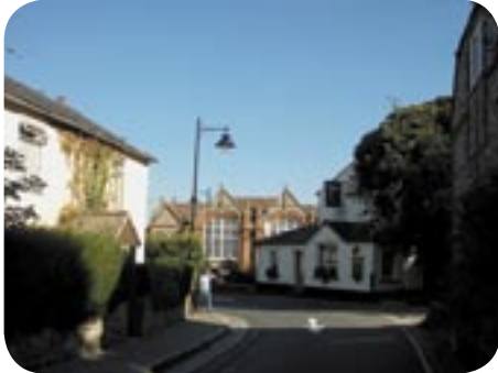
Bounty Road looking towards Victoria Street