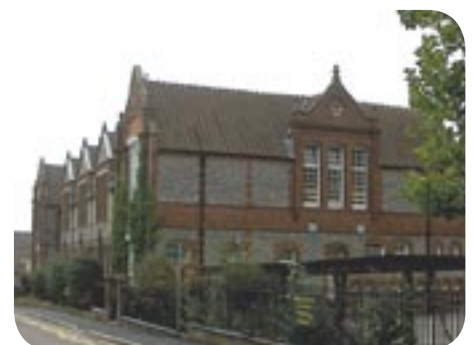
Fairfields Primary School