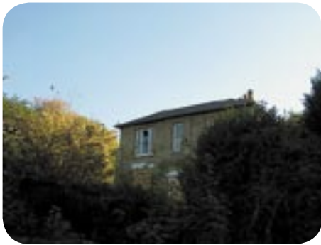
24 Winchester Road