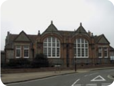
Fairfields Arts Centre

It has been subject to consultation with Councillors, local amenity groups, and residents. A full list of consultees, copies of their responses, and details of the Council's consideration of the issues raised during the consultation period, are available for inspection, at the Civic Offices, by appointment during normal office hours.