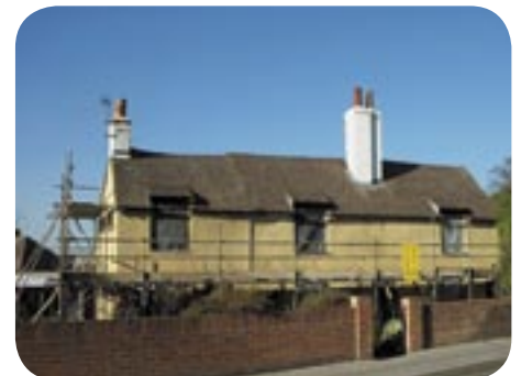
41 Winchester Road