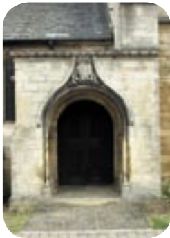
All Saints Church