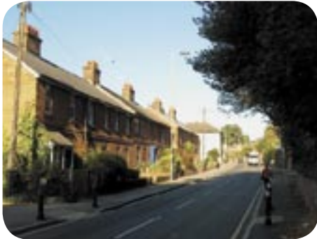
Terraces in Winchester Road

The area between Council Road and Cliddesden Road is a largely rectilinear grid pattern development, with a strongly planned feel. However it retains a spacious feel, with moderately wide streets and a mixture of terraced, semi-detached and detached properties of varying ages. In contrast, the area west of Council Road is dominated by the open space of the May's Bounty Cricket Ground, with the linearly developed Bounty Road running down to Winchester Road.