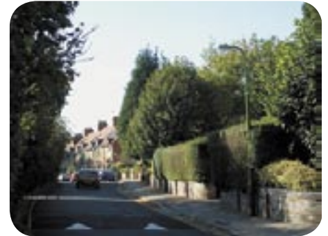
Bounty Road - dwarf brick and flint boundary walls

A number of larger properties in the area, in particular along Cliddesden Road, and to the western end of Wallis Road, sit within comparatively large plots. Although largely screened from public view, these private