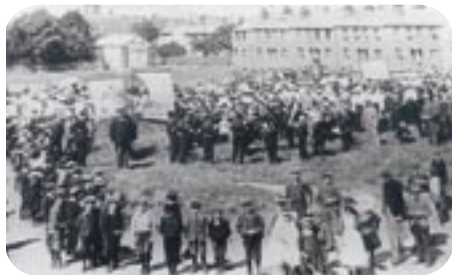
The empty School site circa 1880