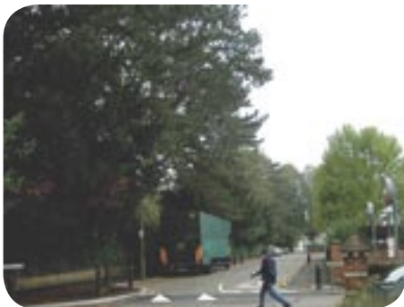
Trees lining Fairfield Road

spaces provide a pleasant contrast to the tightness of the otherwise prevailing small plots of the area. This is evident from the sudden enlargement of spacing between buildings.