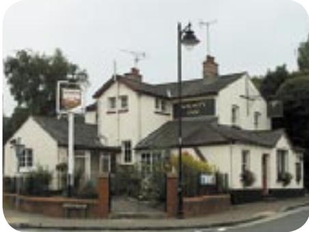
The Bounty Inn

The Bounty Inn is a significantly smaller building, but one which has a key social role in the area, and occupies a prominent location at the top of Victoria Street.