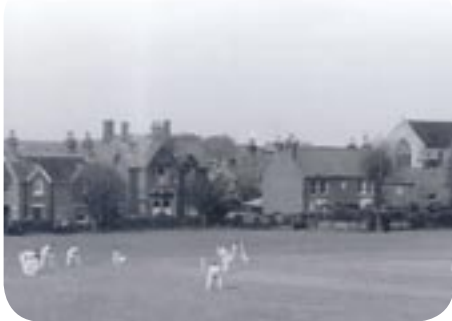
Mays Bounty - originally known as "The Folly"

Much of the land in the western half of the Conservation Area came into the possession of Basingstoke Corporation, and this land has been little built upon since. Housing development in the rest of the Conservation Area progressed slowly throughout the second half of the nineteenth and first half of the twentieth centuries. This resulted in an interesting mix of housing types and styles.