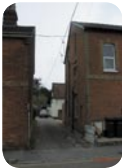
Yard off of Jubilee Road