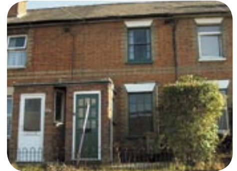
The effect of window replacement