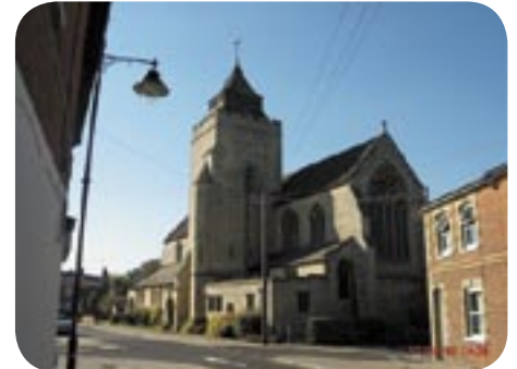
All Saints Church

Undoubtedly the most dominant unlisted building in the area is the former Board School, now known as Fairfields Primary School. Together with the Fairfields Arts Centre (formerly the Infant School), it forms a focal point at the centre of the area, and acts as a landmark within and beyond the immediate vicinity. The tower of the school can be seen from long distances throughout the town. Tall developments within the core area of the town could block long views of the school and of the church, and so must be carefully considered in terms of location and height.