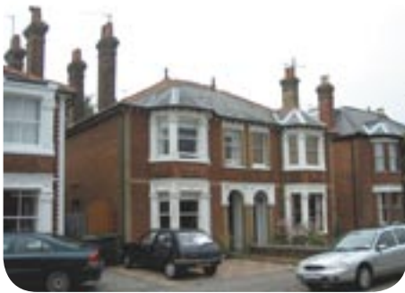
Paired houses in Beaconsfield Road