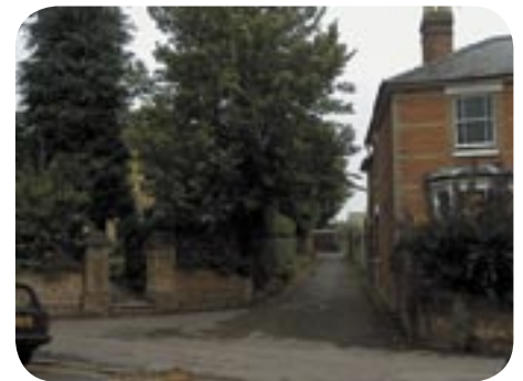
Alleyway between Cliddesden Road and Beaconsfield Road