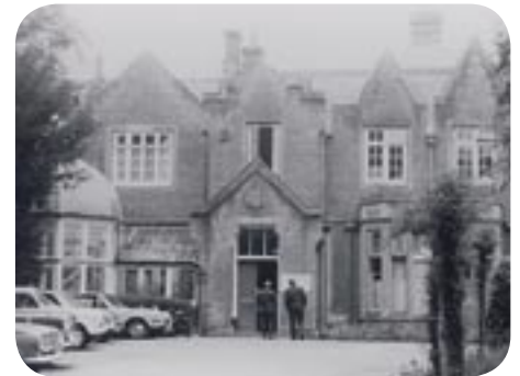
The Shrubbery - demolished 1992